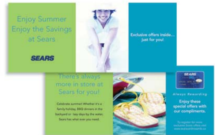
CREDIT CARD STATEMENT INSERT