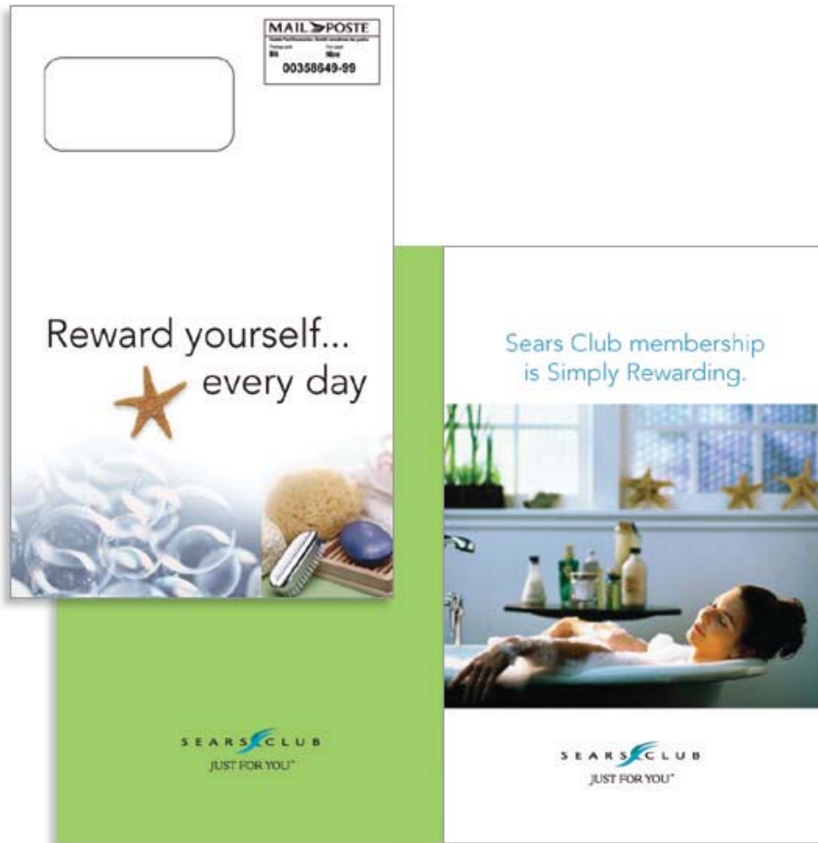
DIRECT MAIL PIECE